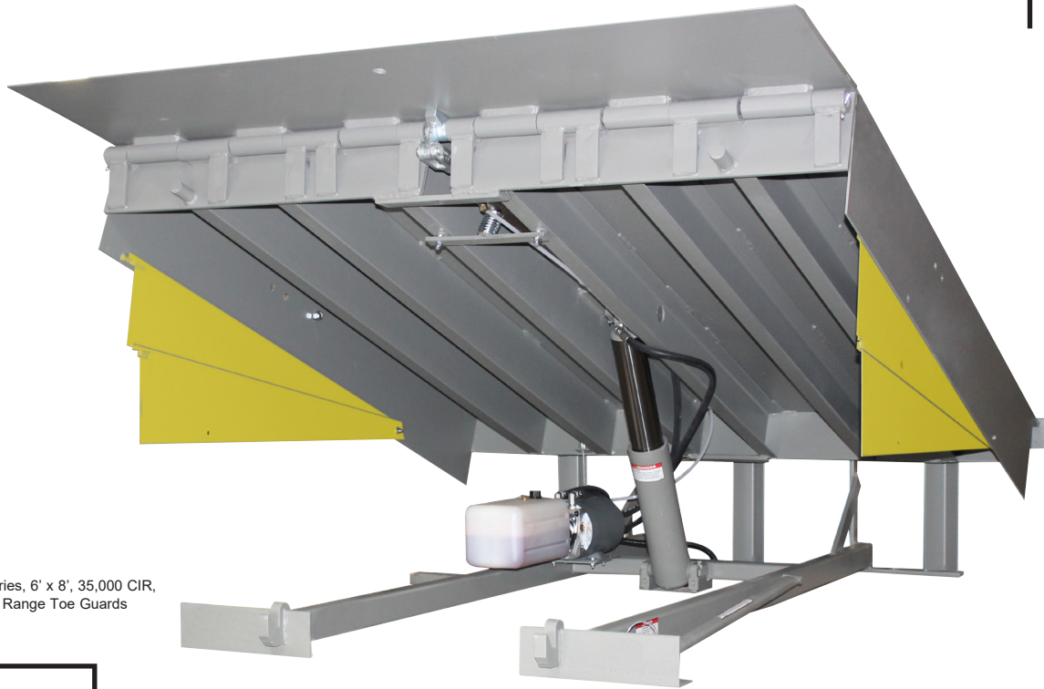
VHD Series, 6' x 8', 35,000 CIR, Full Range Toe Guards