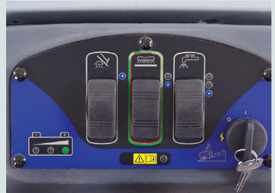
The ST 26 inch disc model – provides simple operation and robust scrubbing controls.