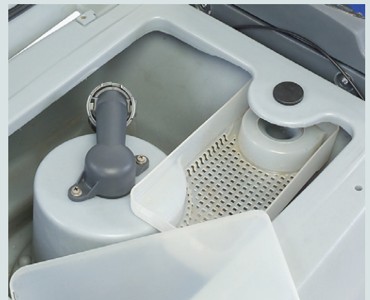
An integrated debris catch cage traps and collects drain clogging debris.